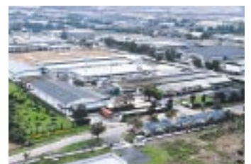
Sumirubber Malaysia Sdn. Bhd.