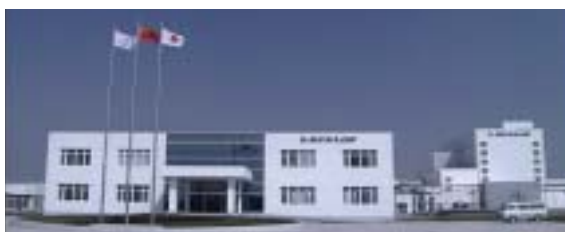
Sumitomo Rubber (Changshu) Co., Ltd. Sumitomo Rubber (Suzhou) Co., Ltd.