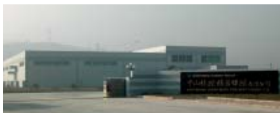
Zhongshan Sumirubber Precision Rubber Ltd. (China)