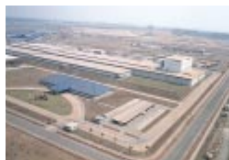
P.T. Sumi Rubber Indonesia