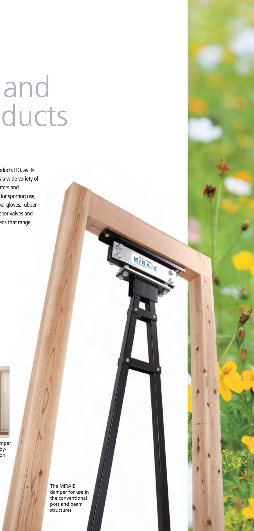
The MIRAIE damper for use in the conventional post and beam structures

* Based on the results of in-house shake table experiments