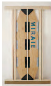
The MIRAIE damper for use in two-by-four construction

Survey conducted by Sumitomo Rubber Industries