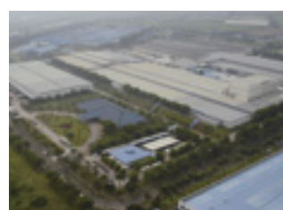
P.T. Sumi Rubber Indonesia