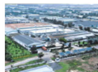
Sumirubber Malaysia Sdn. Bhd.