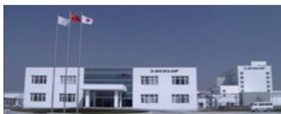
Sumitomo Rubber (Changshu) Co., Ltd. Sumitomo Rubber (Suzhou) Co., Ltd.