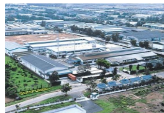
Sumirubber Malaysia Sdn. Bhd.