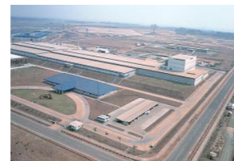
P.T. Sumi Rubber Indonesia