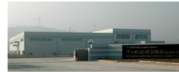
Zhongshan Sumirubber Precision Rubber Ltd. (China)