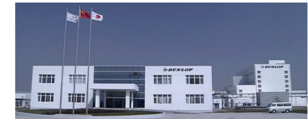
Sumitomo Rubber (Changshu) Co., Ltd. Sumitomo Rubber (Suzhou) Co., Ltd.