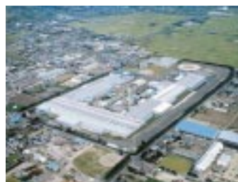
Miyazaki Factory (Ohtsu Tire)