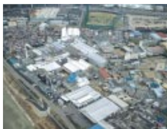
Izumiohtsu Factory (Ohtsu Tire)