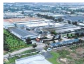
Sumirubber Industries (Malaysia)