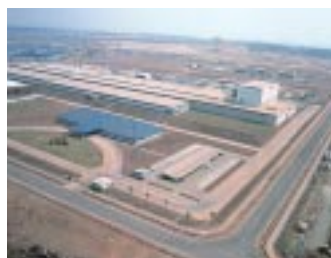
Sumi Rubber Indonesia