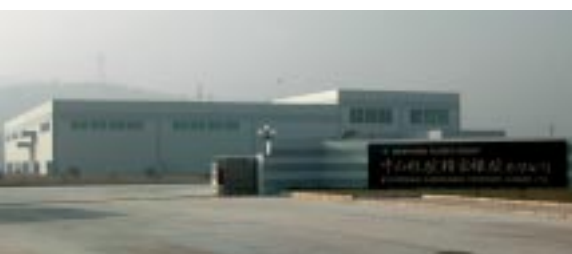
Zhongshan Sumirubber Precision Rubber (China)