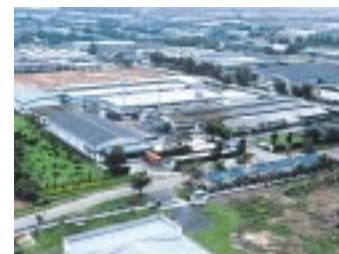
Sumirubber Industries (Malaysia)