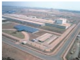
Sumi Rubber Indonesia