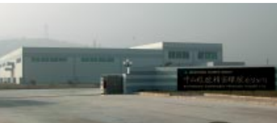
Zhongshan Sumirubber Precision Rubber Ltd. (China)