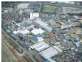
Izumiohtsu Factory (Ohtsu Tire)