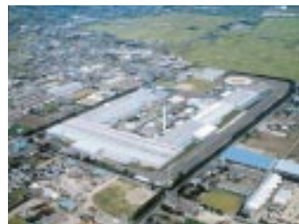
Miyazaki Factory (Ohtsu Tire)